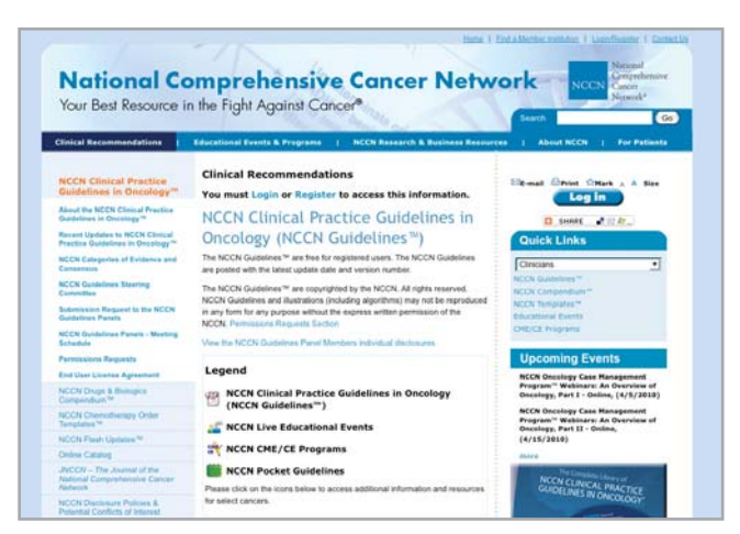
The NCCN Web site

Motor and cognitive impairment usually resolve spontaneously within 2 weeks of stable opioid administration. Sedation may require a dose reduction, more frequent administration to reduce peak concentration, or the addition of caffeine, a psychostimulant, or modafinil. Respiratory