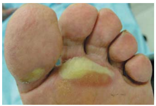
FIGURE 2. Hand-foot skin reaction as seen on the the foot

Previous studies of this syndrome suggest that histologically, the acute erythema of HFS is nonspecific and consistent with a generalized toxicity. Patterns of epidermal cytotoxic injury with mild lymphocyte-predominant dermal infiltrates are described.<sup>2,3</sup> Three histopathologic features predominate and are typically associated with traditional